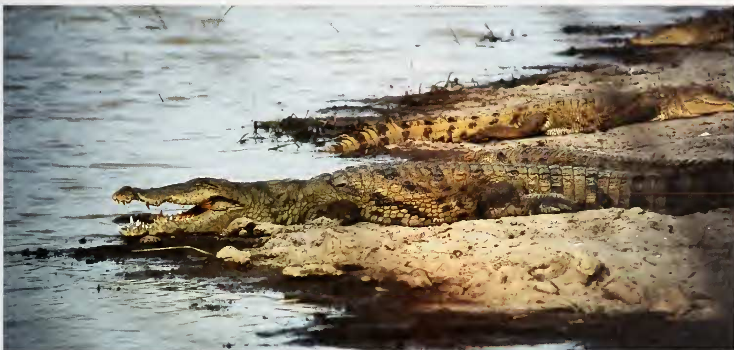
Fig. 19. Crocodylus suchus , Pendjari NP.

Tarentola ephippiata – Bauer et al. (2006): Pendjari NP.